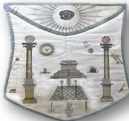
The Lafayette Apron